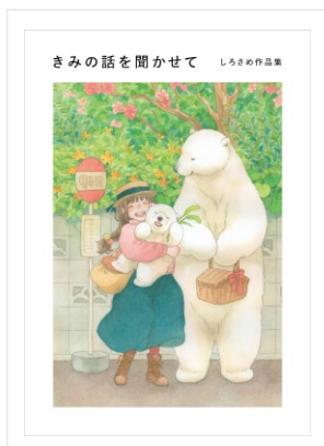
Shirosame Artbook © Shirosame / ShoPro 2023