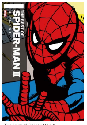
The Best of Spider-Man II ©2024 MARVEL