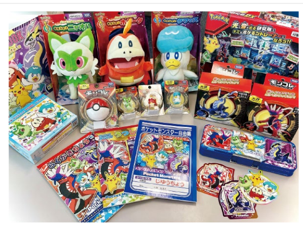
@{\sf Nintendo} \cdot {\sf Creatures} \cdot {\sf GAME} \; {\sf FREAK} \cdot {\sf TV} \; {\sf Tokyo} \cdot {\sf ShoPro} \cdot {\sf JR} \; {\sf Kikaku} \; @{\sf Pokémon}