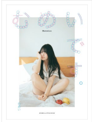
I am MUMEI. © Mumei / ShoPro 2024