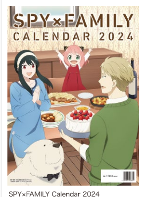
SPY×FAMILY Calendar 2024 ©Tatsuya Endo/Shueisha, SPY×FAMILY Project