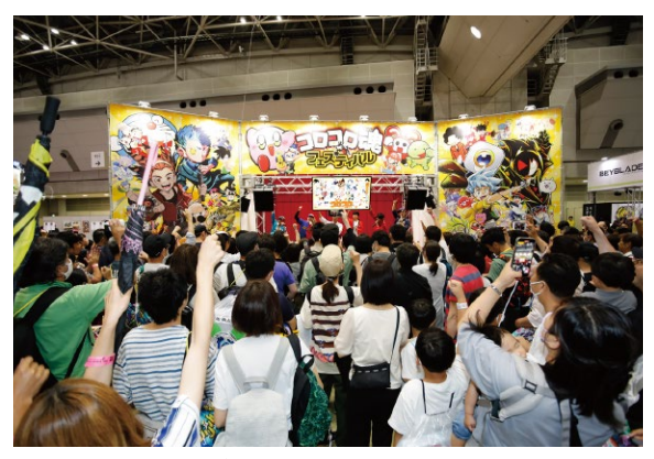
▲コロコロ魂フェスティバル2023 in 東京おもちゃショー