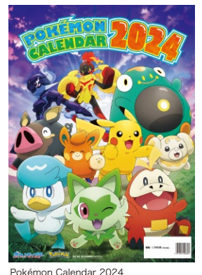
Pokémon Calendar 2024 © Nintendo·Creatures·GAME FREAK· TV Tokyo·ShoPro·JR Kikaku © Pokémon