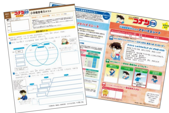
Shogakukan Thinking Skills Test and Advice Sheet

Books Planned and produced by the Education Content Development Office