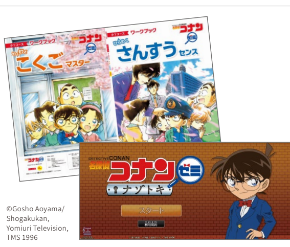
©Gosho Aoyama/Shogakukan, Yomiuri Television, TMS 1996