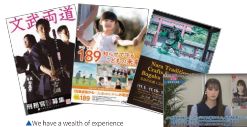
▲ We have a wealth of experience in producing posters, leaflets, and videos.