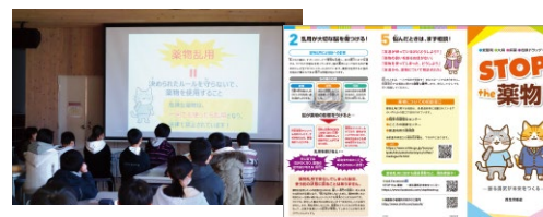
▲ We visit educational institutions and events across the country to promote various initiatives to prevent drug abuse.