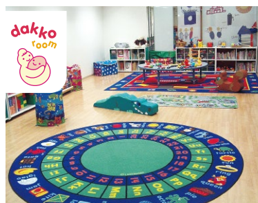
Childcare Room Dakko Room (Shinagawa Prince Hotel)