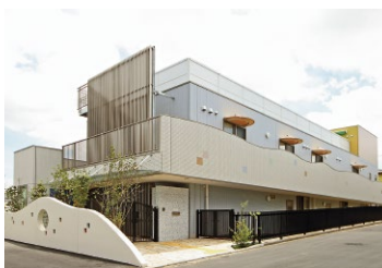
Shogakukan Academy Ryokuentoshi Nursery School