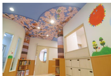
Shogakukan Academy Iidabashi Garden Nursery School