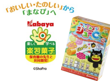
Corporate Collaboration Project